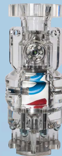
Transparent Cutting Tool Model