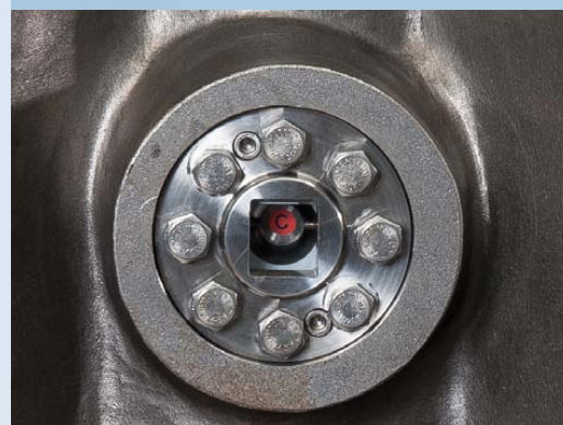
Visual mode indicator