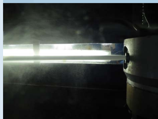
Coherent Water Jet